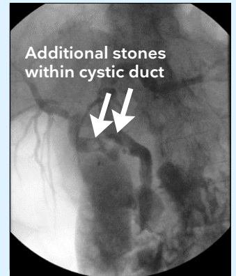
Figure 3: Fluoroscopy showing additional stones within the abnormally draining cystic duct.

The balloon catheter was advanced through the cystic duct into the gallbladder aided by guide wire, but attempts at stone removal failed. The stones were then pushed into the gallbladder by flushing the cystic duct with saline.